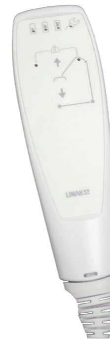
Hand Switch with Battery Charge Indicator