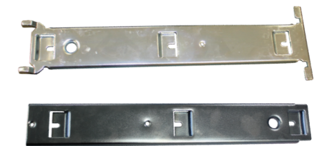
Wall Mounting Bracket & Couch Mounting Brackets