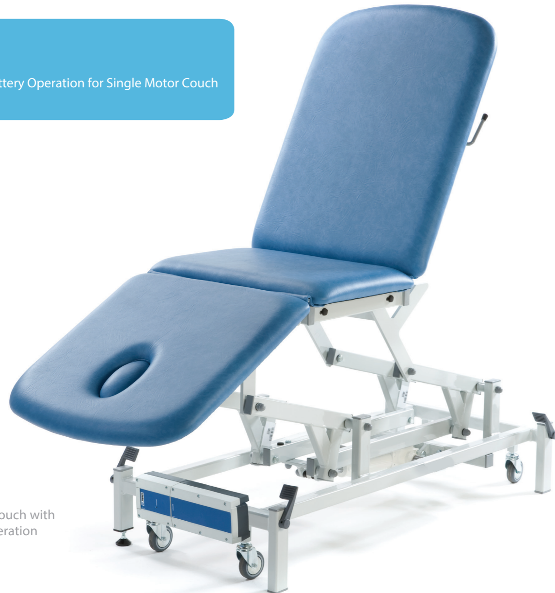
Therapy 3 Section Couch with Linak Battery Operation

6075 Battery Operation for Single Motor Couch