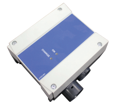
Wall Mountable Battery Charger