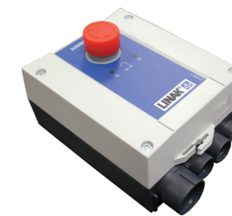
Control Box with Emergency Cut-Out