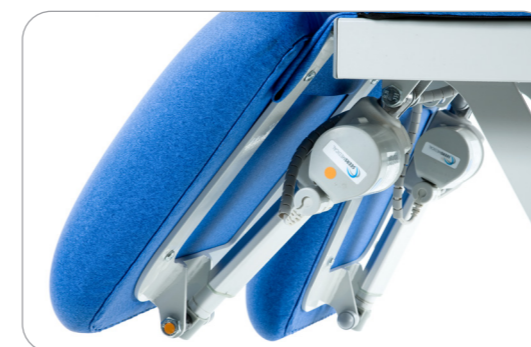
Dual Adjustable Electric Footrests on SM3584