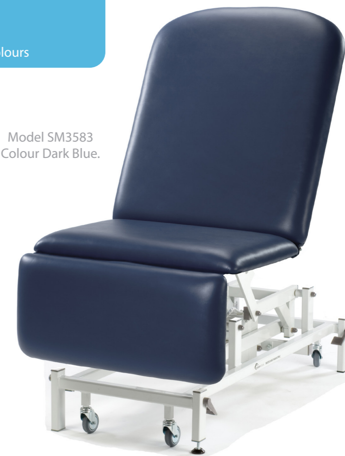
Model SM3583 Colour Dark Blue.