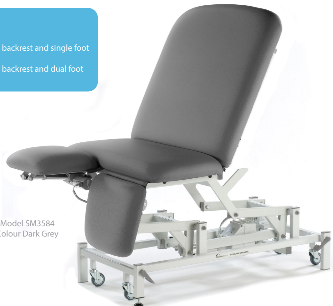
Model SM3584 Colour Dark Grey