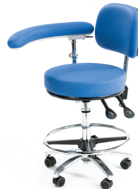
Model MC6161 Colour Diabolo Cobalt Colour available at additional cost

Fully adjustable 360° swing around arm fitted as standard on all models