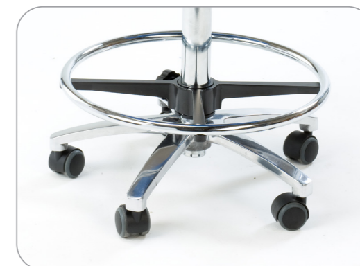
Foot Support Ring fitted as standard on Models MC6161 & MC6163