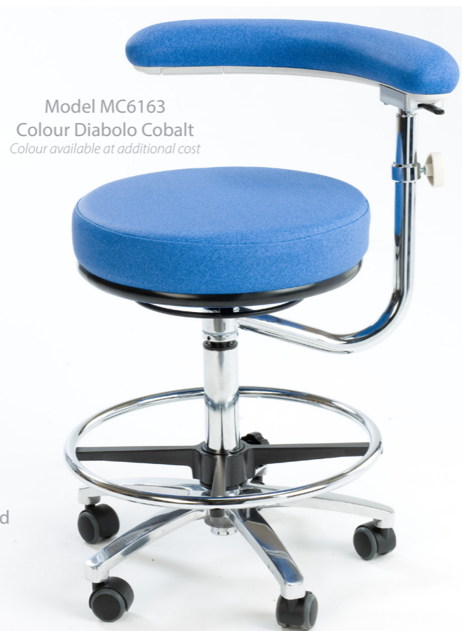
Model MC6163 Colour Diabolo Cobalt Colour available at additional cost