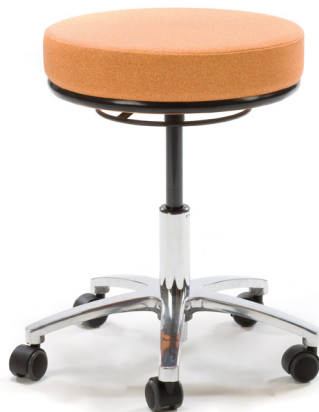
Model MC6164 Colour Diabolo Mandarin Colour available at additional cost

All round height adjustment ring, fully upholstered under side for ease of cleaning