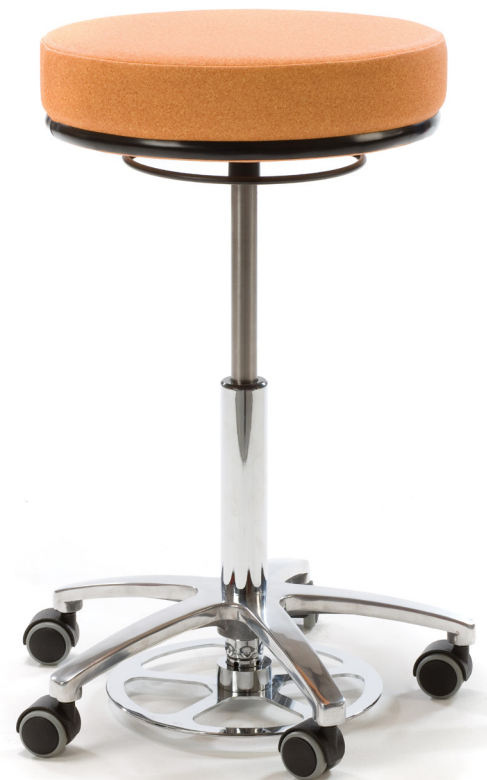
Model MC6165 with 6174 Foot Height Control Colour Diabolo Mandarin Colour available at additional cost